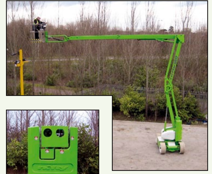
The Nifty HR17N's narrow base and outstanding outreach are ideal for tasks where floor space is limited or crowded and optional non-marking tyres make it perfect for industrial or maintenance work.