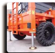
Automatic Leveling Outriggers