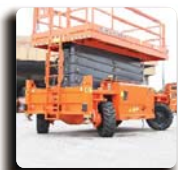
Multiple steering modes