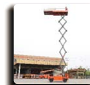
Full Stroke Traveling